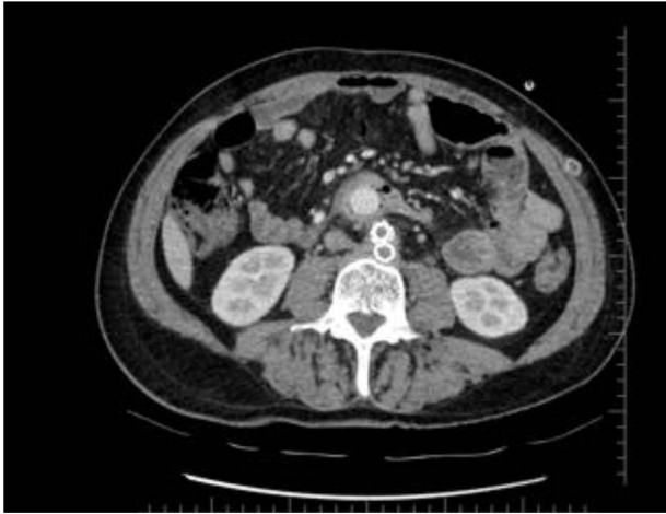
Figure 1: Axial section shows the two limbs of the EVAR, at the bottom. And on top of it, the Dacron straight graft part in the middle of the jejunum.