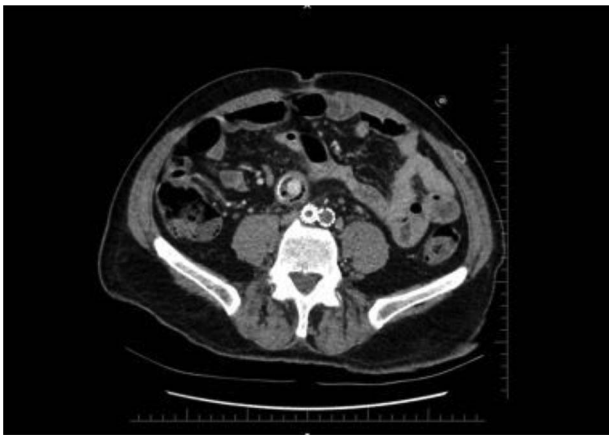
Figure 2: Distal CT axial section shows the two limbs of the EVAR, at the bottom. And on top of it, the Dacron straight graft part in the middle of the jejunum.

axillo-femoral grafts occlusion. An aorto-bifemoral bypass was performed (21 August 2017). Post-operatively, the patient did fine and he was discharged on the seventh post-operative day. On 8 May 2018, the patient presented with both inguinal region discharge and fatigue. His CRP level was above the normal limits. Wound culture revealed no microorganism growth.